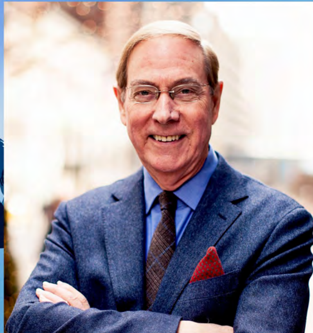
Guest Speaker & Author, Gary Chapman

Tuesday, April 18, 2023 at 6:30 pm Doors open at 6:00 pm