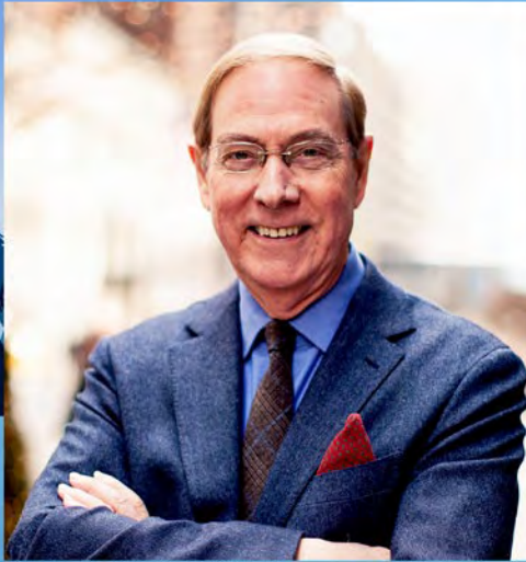
Guest Speaker & Author, Gary Chapman